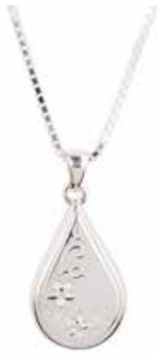
Etched Teardrop Price: $280