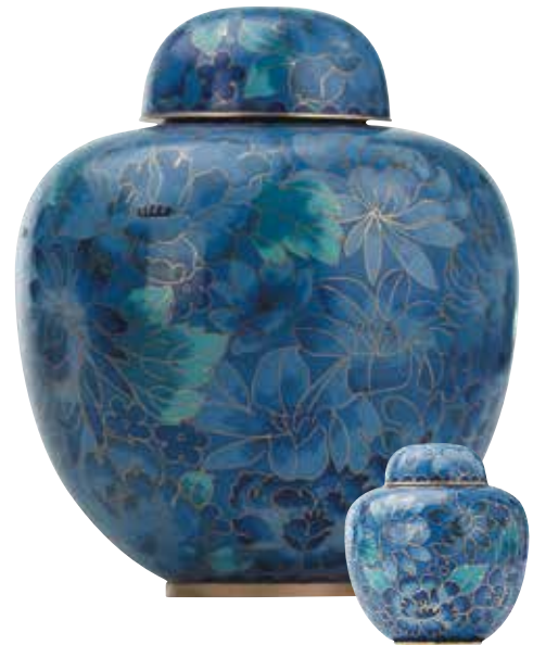
Blue Sapphire & Blue Sapphire Keepsake Traditional Cloisonné design with intricate pattern