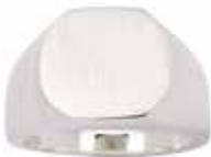
Signet Ring Price: $195