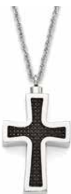
Carbon Fiber Cross Price: $165