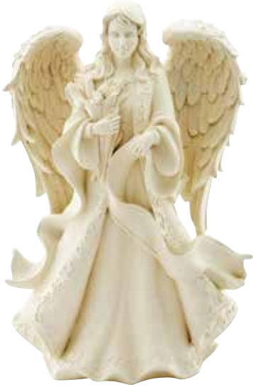
Margarita 22" H x 14" Dia. Volume: 365ci Price: $300

Garden memorials offer you the opportunity to memorialize your loved one at home. Many of our garden memorials can be personalized with a small plaque as a special tribute.