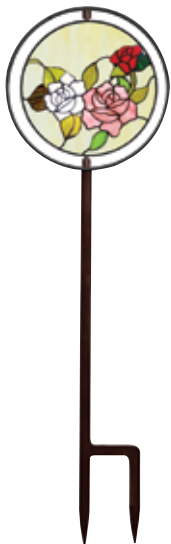
Rose Garden Panel 43 1/2" H x 14 3/4" Dia. Price: $255