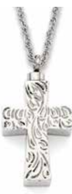
Etched Cross Price: $140