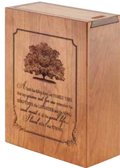
Family Tree Scattering Urn

Cherry scattering urn with engraved image & quote