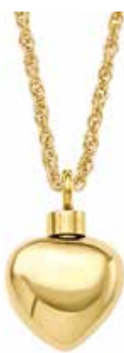
Small Heart IP Plated Price: $120