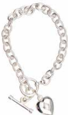
Toggle Closure Charm Bracelet with Heart w/ Clear CZ Stone Price: $245