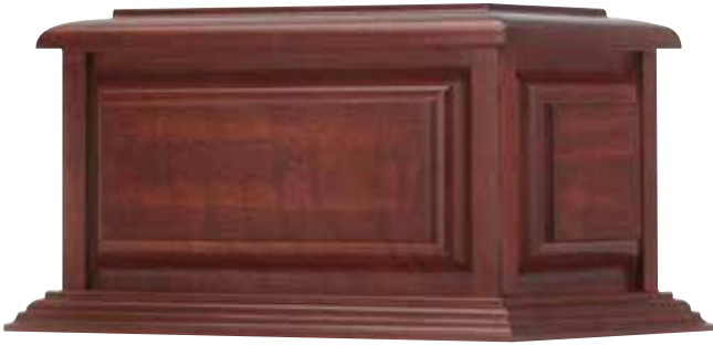
Eternity Natural cherry hardwood urn