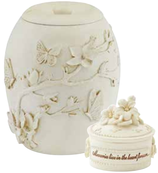
Blossoms and Butterflies & Blossom Keepsake Composite statuary urn with 3D detail