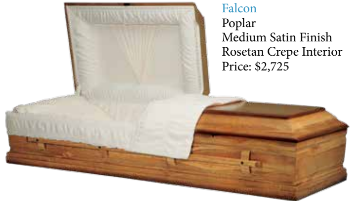
Falcon Poplar Medium Satin Finish Rosetan Crepe Interior Price: $2,725