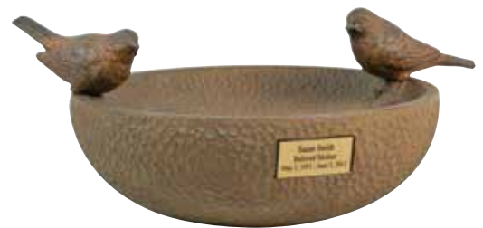
Bird Bath 8" H x 15 1/2" Dia. Price: $195

All garden memorials hold small amounts of cremated remains.