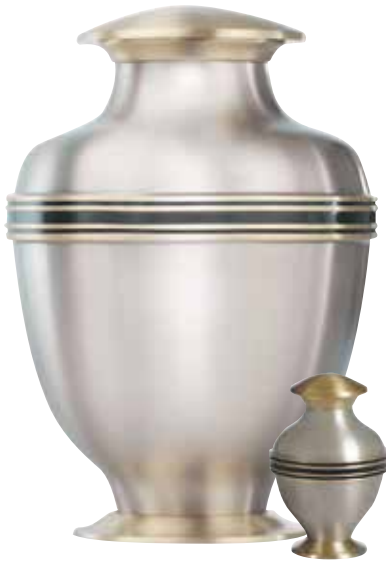
Venice & Venice Keepsake

Brass urn with pewter finish in classic design