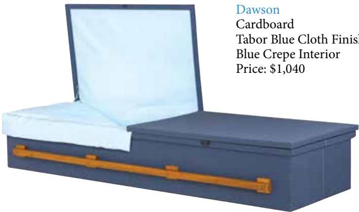
Dawson Cardboard Tabor Blue Cloth Finish Blue Crepe Interior Price: $1,040