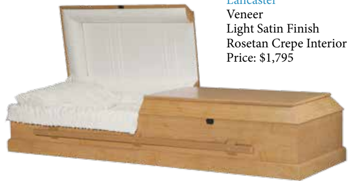
Lancaster Veneer Light Satin Finish Rosetan Crepe Interior Price: $1,795