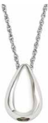
Large Teardrop Price: $140