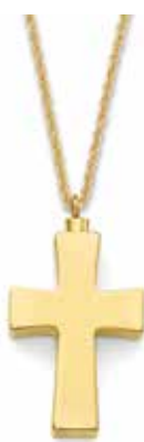
Small Cross IP Plated Price: $140