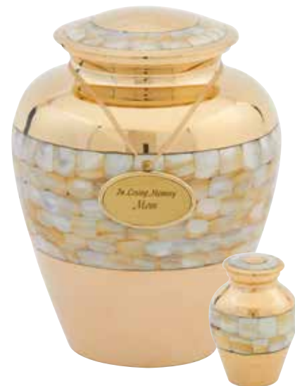
Mother of Pearl & Mother of Pearl Keepsake Brass urn with natural mother of pearl. Charm not included.