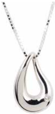
Open Teardrop w/ Clear CZ Stone Price: $165