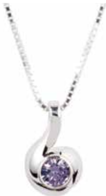
Swirl w/ Birthstone Shown w/ February Price: $165