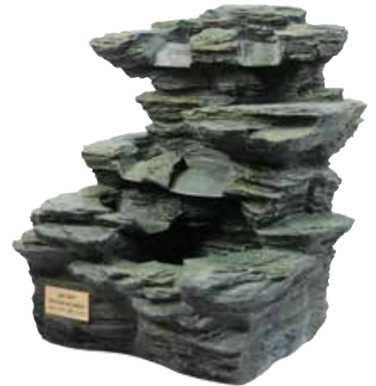
Serenity Falls 17 7/8" H x 16 1/2" Dia. Price: $295