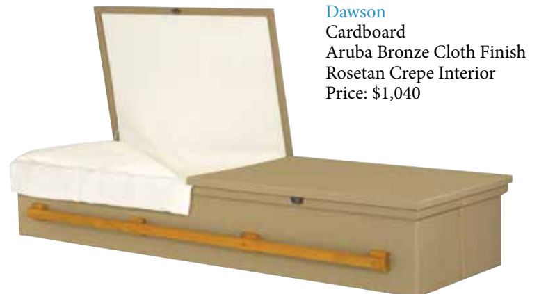
Dawson Cardboard Aruba Bronze Cloth Finish Rosetan Crepe Interior Price: $1,040