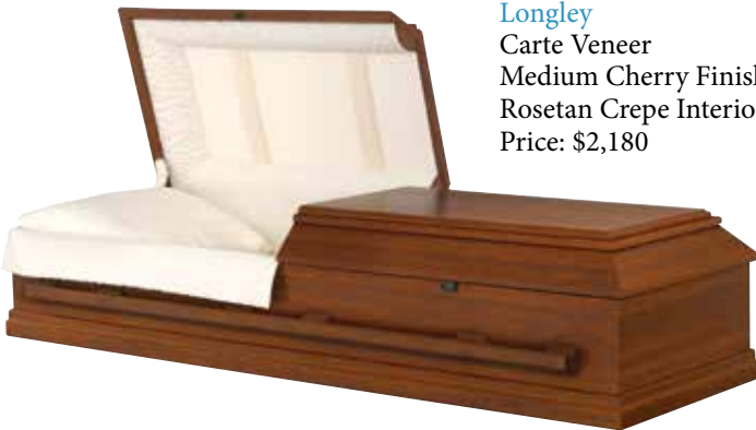
Longley Carte Veneer Medium Cherry Finish Rosetan Crepe Interior Price: $2,180