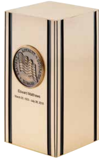
Fidelity Roma Cast bronze urn in simple design. Shown w/ optional personalization.