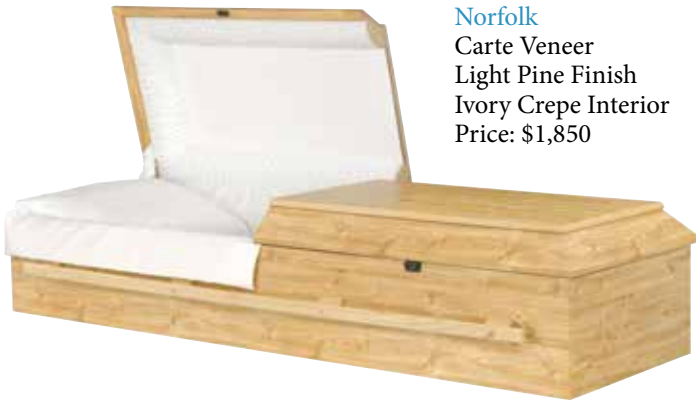
Norfolk Carte Veneer Light Pine Finish Ivory Crepe Interior Price: $1,850