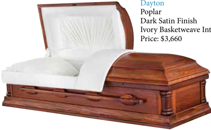
Dayton Poplar Dark Satin Finish Ivory Basketweave Interior Price: $3,660