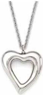
Open Heart Price: $120