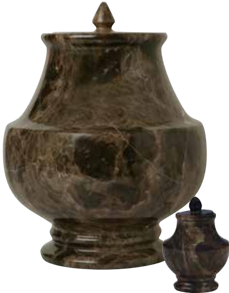
Mallorca & Mallorca Keepsake