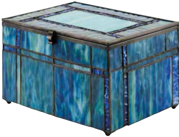
Seaside Handmade stained glass memory chest