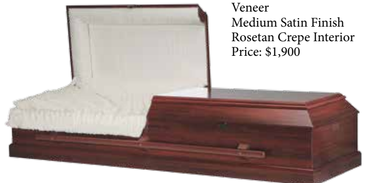
Kenton Veneer Medium Satin Finish Rosetan Crepe Interior Price: $1,900