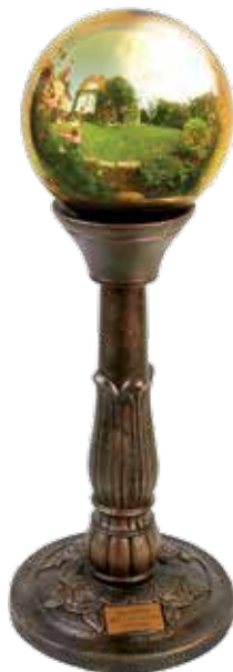
Gazing Ball 31" H x 12" Dia. Price: $245