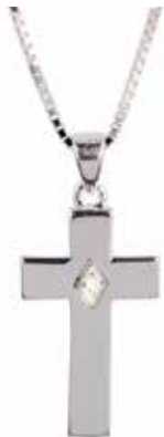
Cross w/ Clear CZ Stone Price: $330