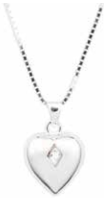
Heart w/ Clear CZ Stone Price: $280