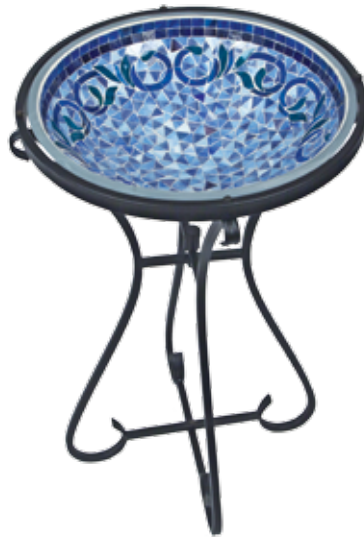
Blue Mosaic Birdbath 22 1/4" H x 15 1/2" Dia. Price: $355