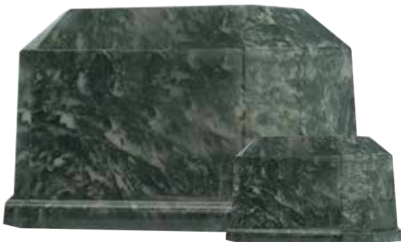
Green Marble & Green Marble Keepsake Cultured marble urn